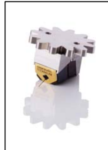
Titanium empf. VK: € 5895,-