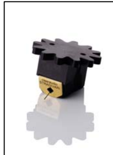
Stradivari empf. VK: € 2505,-