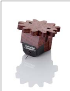
Concerto empf. VK: € 1775,-