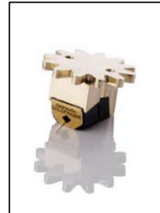
Goldfinger empf. VK: € 8245,-